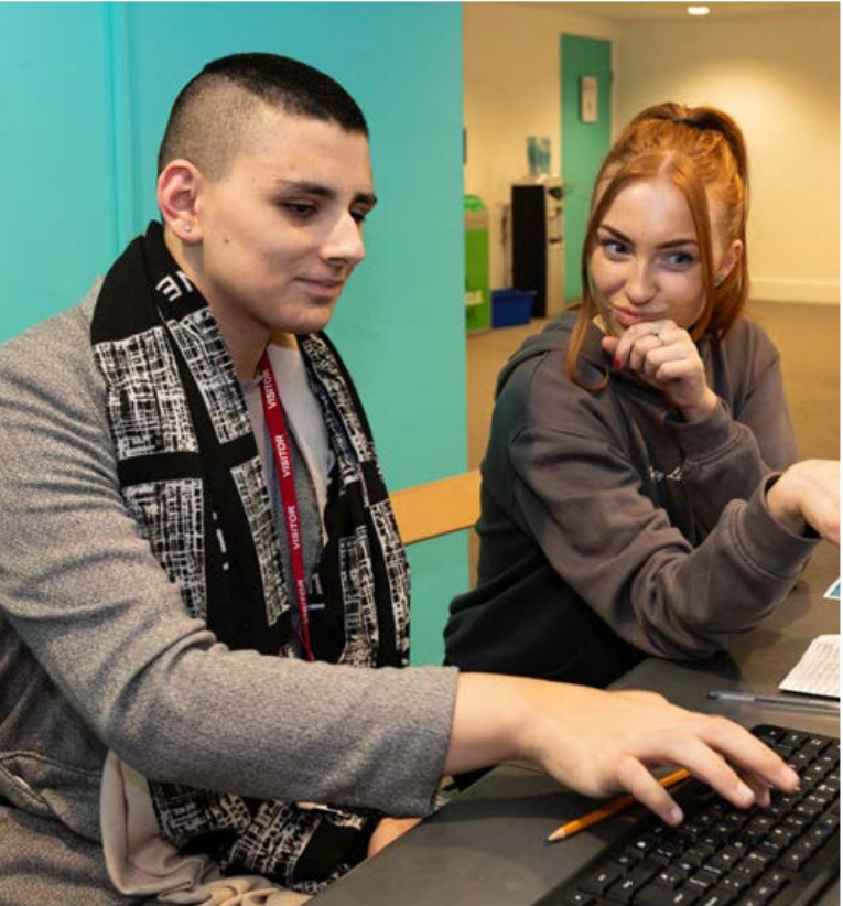
Left: Young people involved in the YES programme are shown how to do various jobs around The Lowry

One such opportunity this year was a paid internship for a young person who had taken part in the YES Programme. This young person is a developing artist; she was paid to come and work alongside Lowry Young Artists to help them collate and pull together their artwork. She offered practical advice, demonstrated different artistic techniques and encouraged the group. It was a real step up in terms of responsibility and commitment, and she responded fantastically to the challenge. We will continue to support the young person on the next step of her journey.