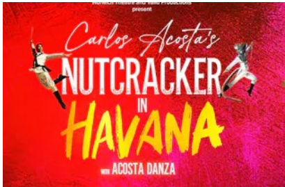
Acosta Danza – Nutcracker in Havana 27 – 28 January

Winner of four Olivier Awards including Best New Musical in London and the Tony Award for Best Direction of a Musical on Broadway, this smash hit show shares the incredible real-life story of the 7,000 air passengers from all over the world who were grounded in Canada during the wake of 9/11, and the small Newfoundland community that invited these 'come from aways' into their lives with open hearts.