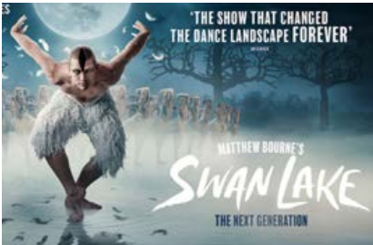
Matthew Bourne's Swan Lake 19 – 30 November

We are so pleased to be able to look back over such a successful year, but even more excited to look ahead at a fantastic programme of art, events and engagement at the heart of our community.