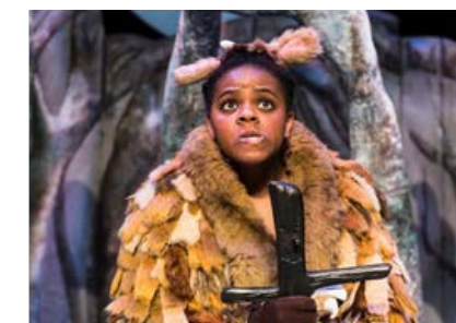
Left: The King & I. Above: The Gruffalo's Child.