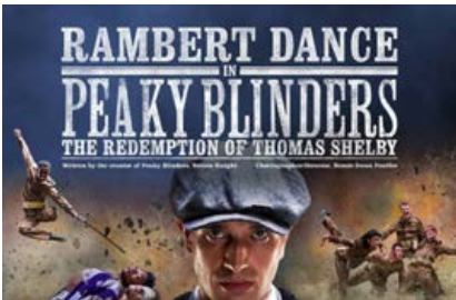
Rambert Dance in Peaky Blinders: The Redemption of Thomas Shelby 22 – 26 October

A glorious revival of this musical theatre masterpiece, with sensational choreography and iconic songs.