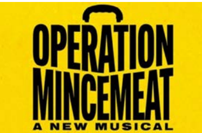
Operation Mincemeat Winter/Spring 2025

A Cuban take on the favourite festive classic, Carlos Acosta's brand-new production explodes onto The Lowry stage, featuring new choreography by Carlos Acosta CBE and performed by more than 20 dancers from his Cuban company, Acosta Danza.