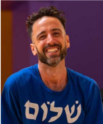
2 BOBAK CHAMPION

Alice Christina-Corrigan opened her latest production FADE in the Aldrige Studio in April; a disabled-led production featuring dynamic new writing, integrated creative access and original music.