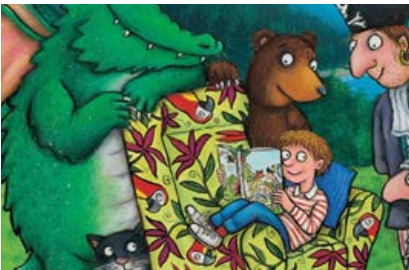
Charlie Cook's Favourite Book 23 July – 4 August

An enthralling and dark tale of 18th Century England, against a backdrop of Handel's Messiah. Helen Edmundson's adaptation of Jamila Gavin's Whitbread Award-winning novel premiered at the National Theatre in 2005 before transferring to Broadway. Nominated for several Olivier and Tony Awards, it won the Time Out Live Award for Best Play.