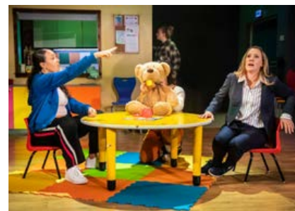
Left: Metamorphosis . Photo by Tristram Kenton. Top: Drive Your Plow over the Bones of the Dead . Photo by Marc Brenner. Bottom: The Good Enough Mums Club by Pamela Raith. Top: Unfortunate: The Untold Story of Ursula the Sea Witch . Photo by Pamela Raith.