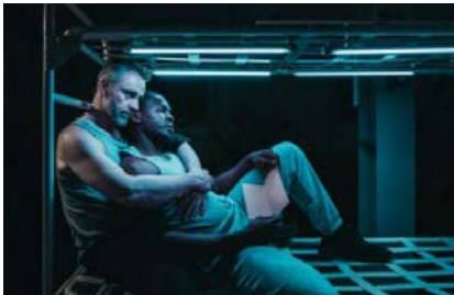
Dante or Die: Kiss Marry Kill 10 – 12 May at Halle St Peters (Commission)

Inspired by real-life events, Kiss Marry Kill is a provocative new play that reimagines the first same-sex wedding in a UK prison. Commissioned by The Lowry, South Street Reading & Ideas Test, with support from Norwich Theatre Royal & Stone Nest.