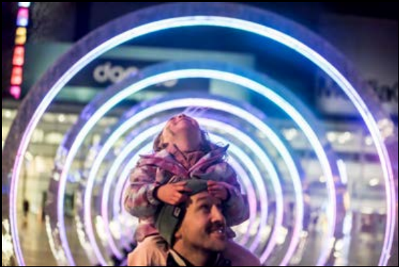
Four brand new commissions and four co-commissions were presented including six world premieres. One of the programme highlights was a performance by 21 of The Lowry's own young CAT dancers from across Greater Manchester interacting with the piece GLOW by Australin artist collective Amigo & Amigo.

Lightwaves Salford also took place from Thursday 7 - Sunday 10 December 2023 and 169,665 visitors of all ages enjoyed illuminated works from established as well as emerging artists, local and national, bringing a variety of different pieces; thought-provoking, surprising playful and all free of charge.