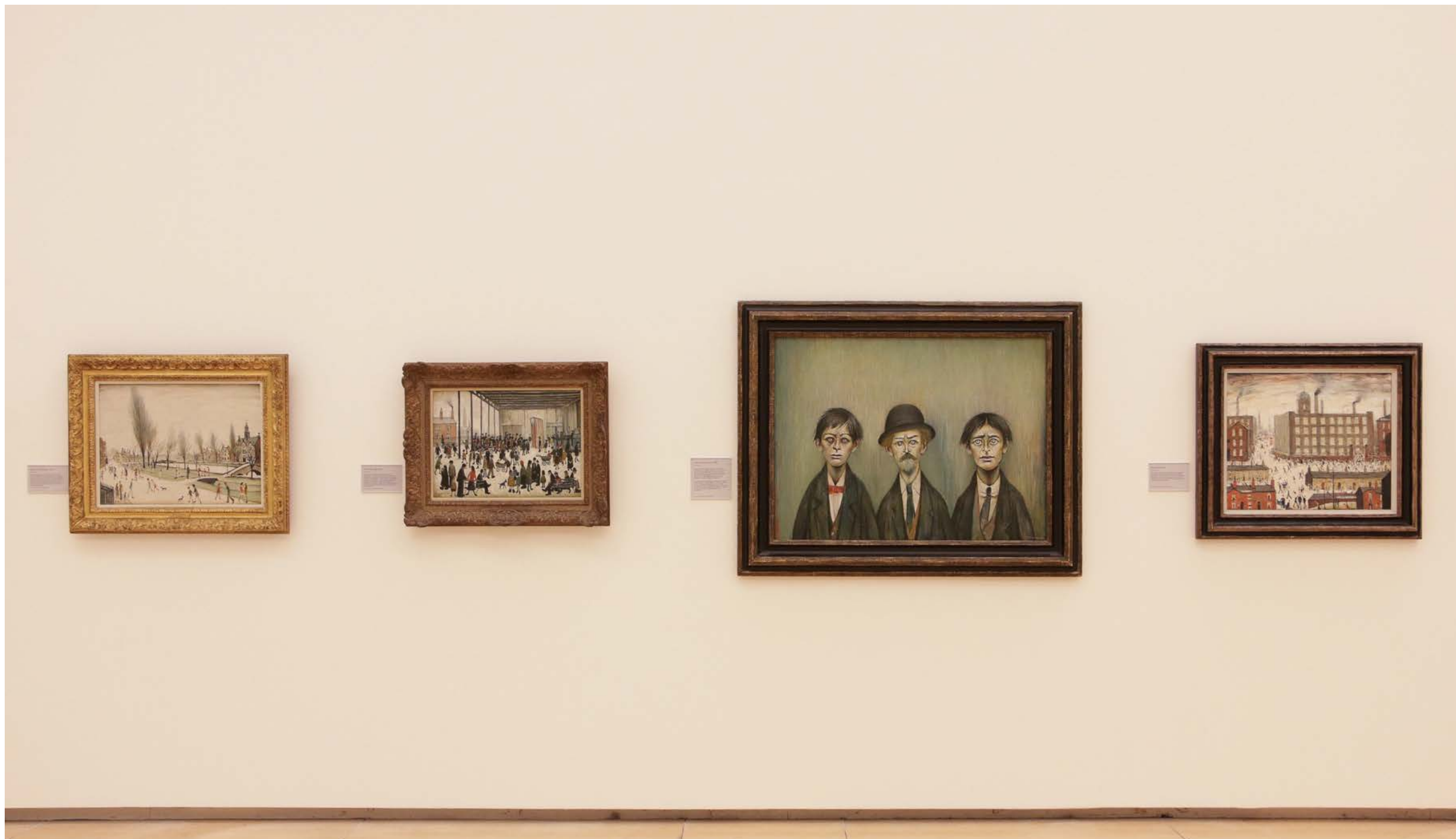
From left to right: LS Lowry Bourton-on-the-Water, 1947, on loan from a private Liechtenstein Collection; LS Lowry Punch and Judy, 1943, on loan from a private Liechtenstein Collection; LS Lowry Father and Two Sons, 1950, on loan from a private Liechtenstein Collection; LS Lowry Mill Scene, 1953, on loan from a private Liechtenstein Collection.