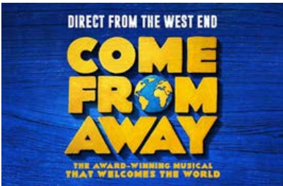
Come From Away 3 December – 5 January

The most successful dance theatre production of all time, Swan Lake will take flight once more in a major new revival for the next generation of dancers, and for audiences who will experience it for the very first time.