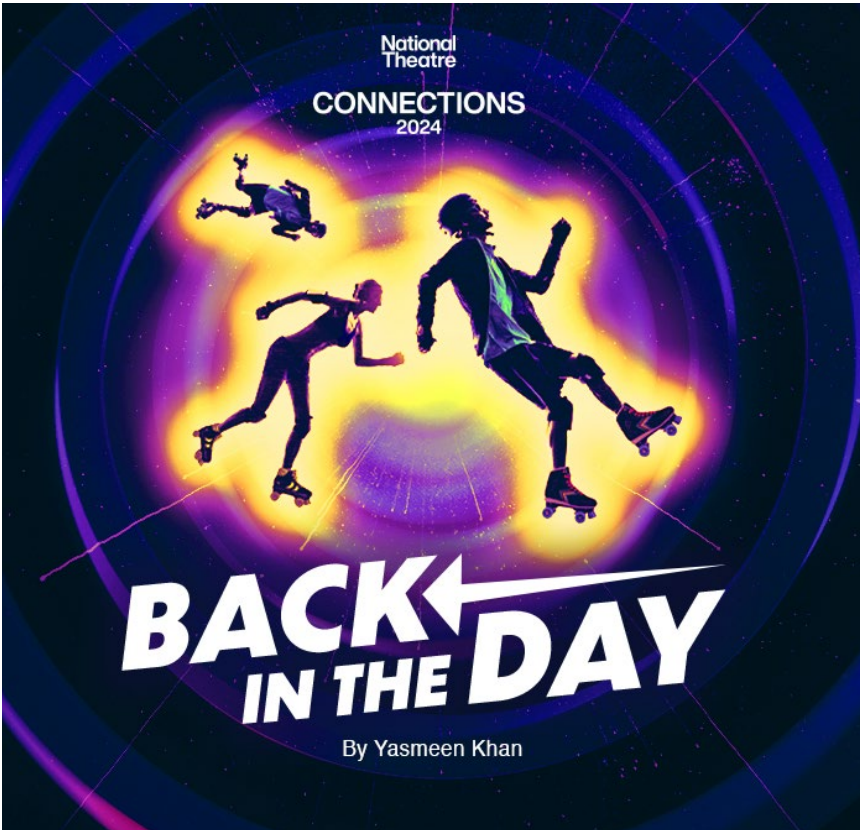
Top: Poster artwork for The Lowry Young Company's performance as part of the NT Connections festival. Bottom and opposite: The Lowry Young Company's performance of Back In The Day.

We were thrilled to once again be invited to be a Partner Theatre for the 2023 for the National Theatre's annual, nationwide youth theatre festival. We welcomed 10 companies to the festival which took place at The Lowry from Friday 28 to Sunday 30 April. Over the course of the weekend, every group took part in a workshop with a professional actor, and spent two hours with our technical team preparing for their performances. Each day culminated with a performance in either the Studio or Quays Theatre with over 350 audience members , made up of family and friends.