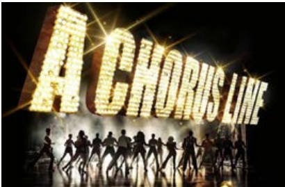
A Chorus Line 23 – 27 July

Co-produced by The Lowry and Little Angel Theatre, this original book by Julia Donaldson and Axel Scheffler is brought to life with enchanting music and puppetry in a celebration of story telling.