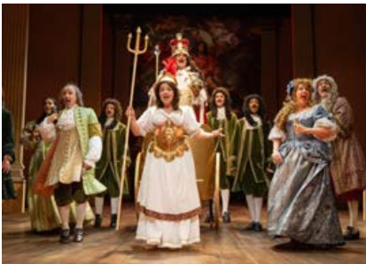
Left: John Bishop and Sir Ian McKellen star in Mother Goose. Above: The Crown Jewels. Next page: Life of Pi.