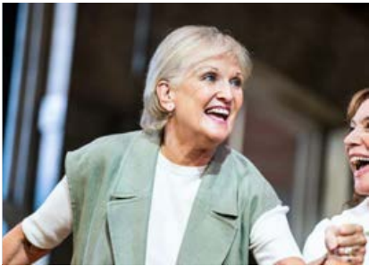
Opposite: Noises Off. Top: The Very Hungry Caterpillar. Above: Calendar Girls.